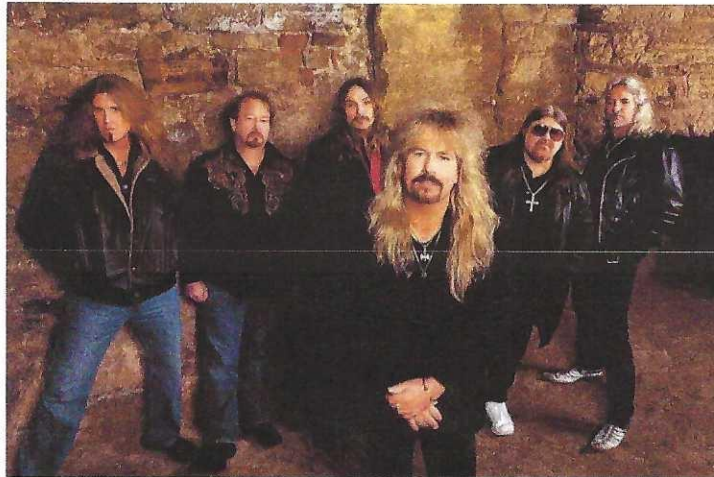
Molly Hatchet Band

Following his time with Buffalo Springfield, Messina and fellow bandmate Richie Furay formed Poco and defined a new musical genre, country rock.